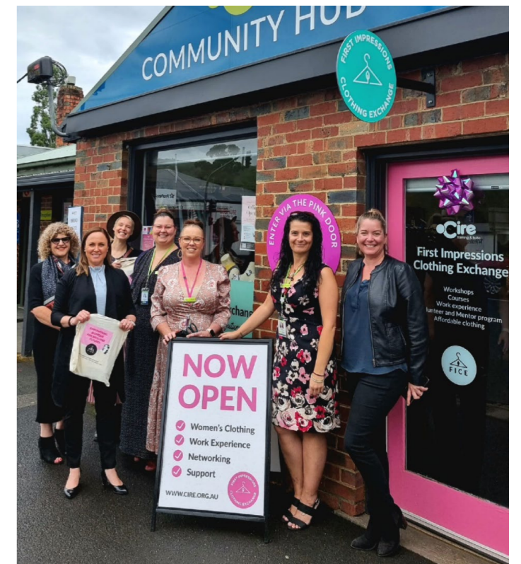
Australian Neighbourhood Houses & Centres Association: (left) a trip for Junction Community Centre to Nildottie in South Australia; (right) the First Impressions Clothing Exchange Yarra Junction official opening