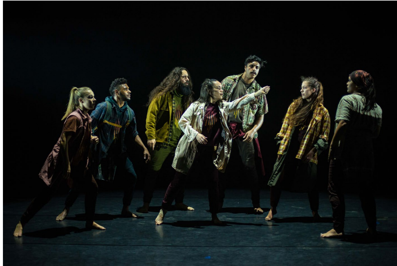
SILENCE by Karul Projects, produced by Blakdance

Since 1984, the Sidney Myer Performing Arts Awards have celebrated excellence in the performing arts and provided direct financial support to artists and companies across Australia.