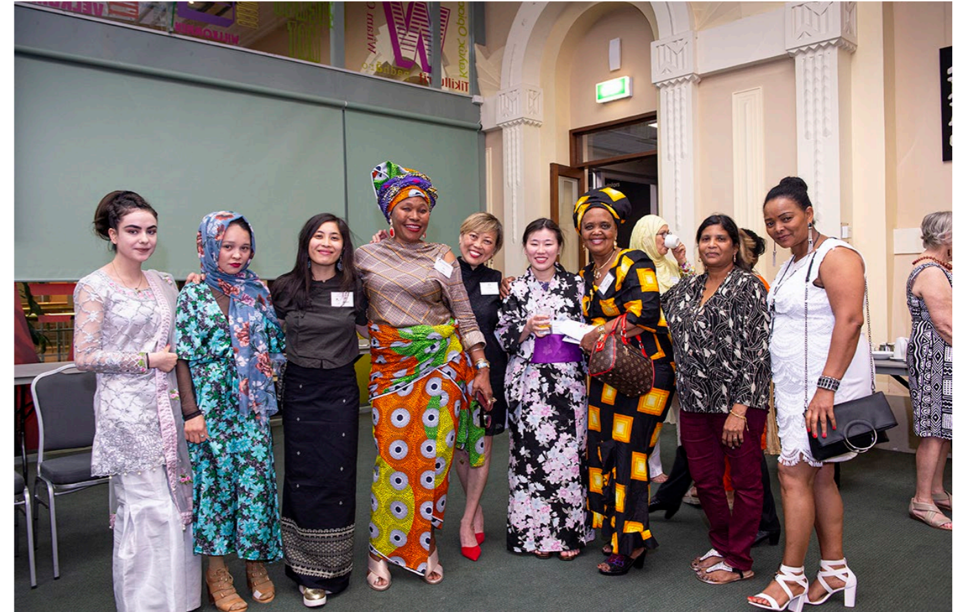
Sisterworks - Bridge Road Hub Launch