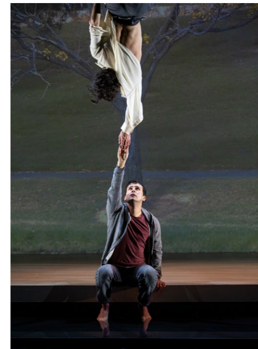
Watershed was a newly commissioned opera at Adelaide Festival