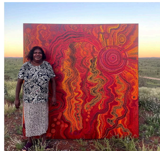
Tjungkara Ken