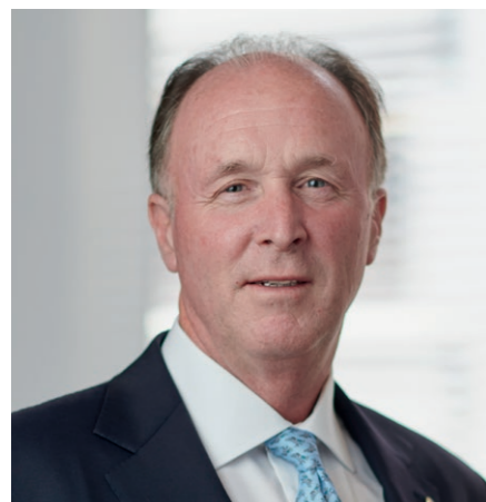
Sidney Myer AM