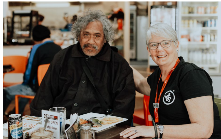
Bendigo Baptist Community Care's Brekky Club