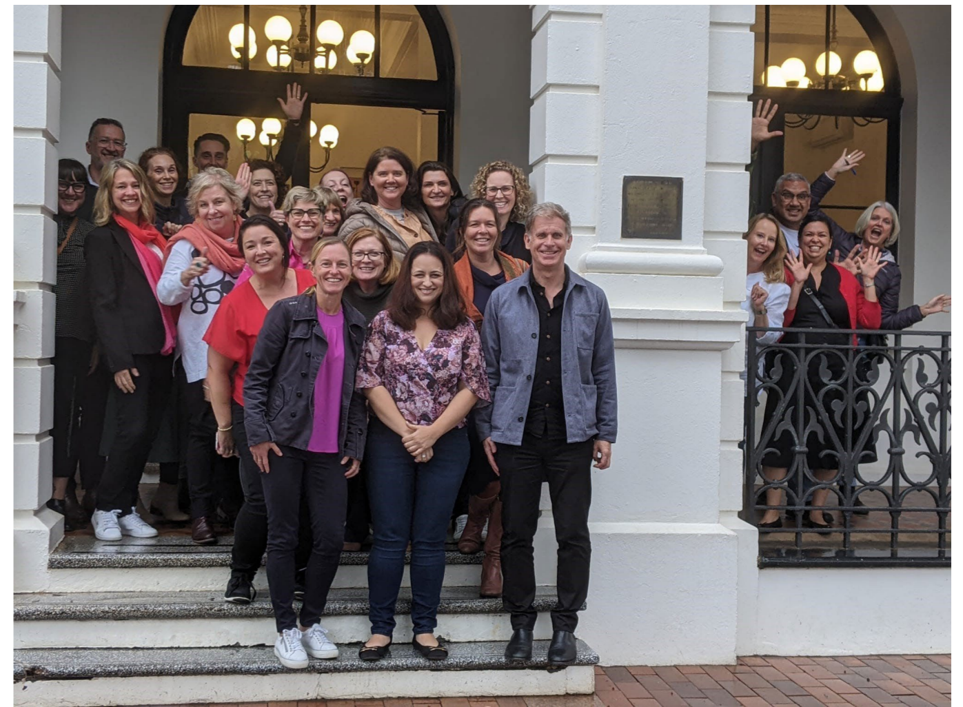
Social Impact Leadership Australia participants gathered together for a joint retreat