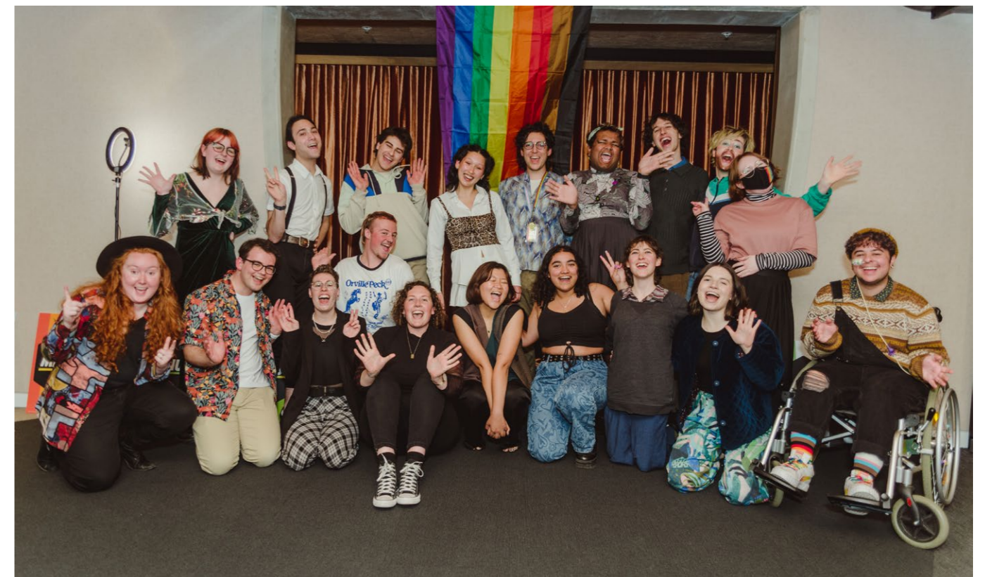
Minus18 is a charity improving the lives of LGBTIQ+ youth