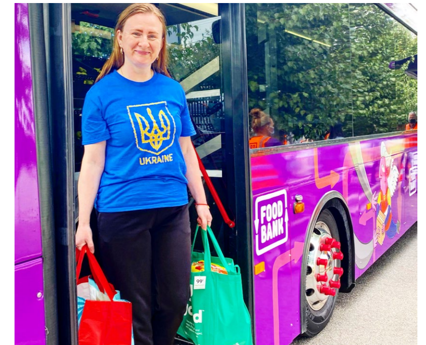
Foodbank VIC converted airport buses into mobile "supermarkets" taking nutritious food to struggling Victorians