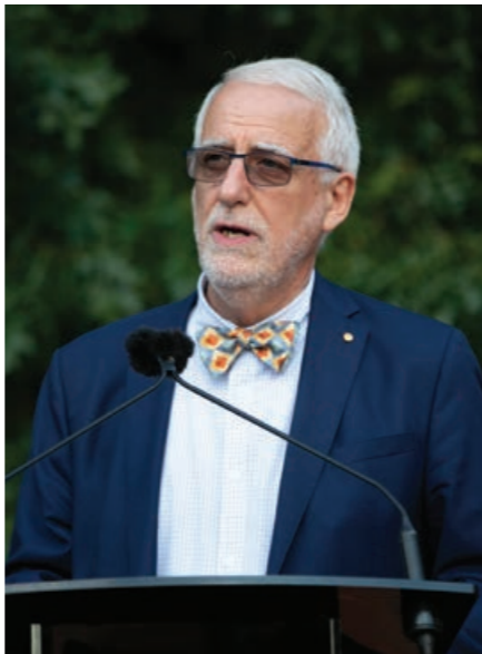
Carrillo Gantner AC introduces the 2019 Award recipients.