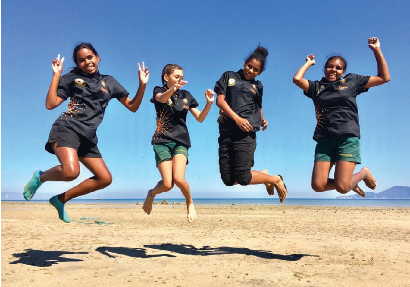
Stars girls enjoying the Stars Foundation Palm Island Reward Camp in September 2019