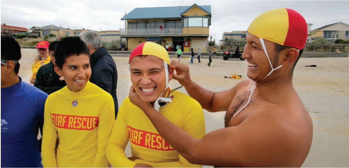
A group of participants in the Community Refugee Sponsorship Initiative.