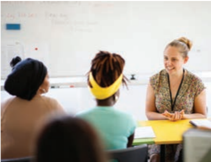
River Nile Learning Centre volunteer tutor and students in an English language class.