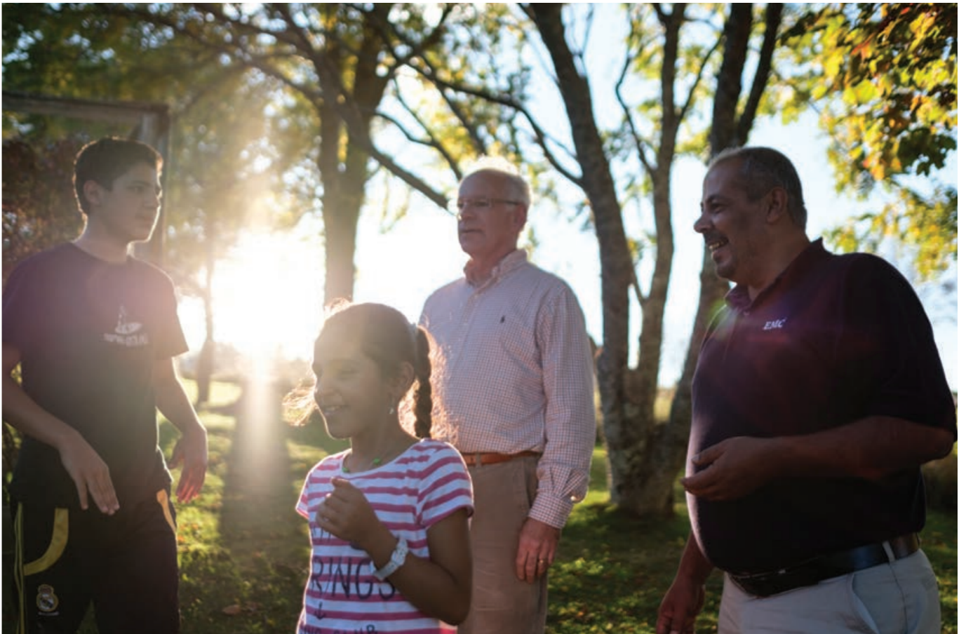
A group of participants in the Community Refugee Sponsorship Initiative.