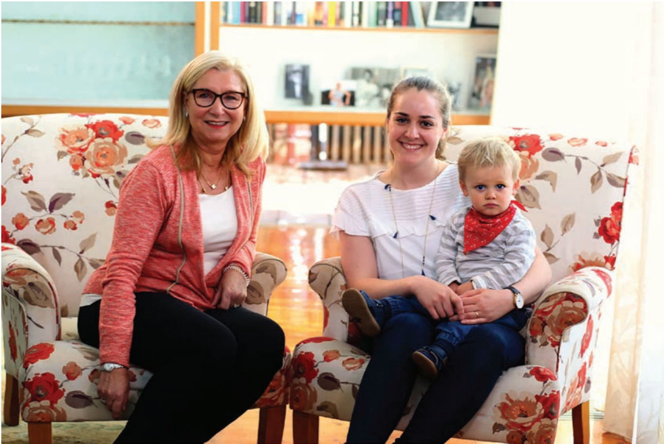
A paired mother and volunteer in the Caring Mums program