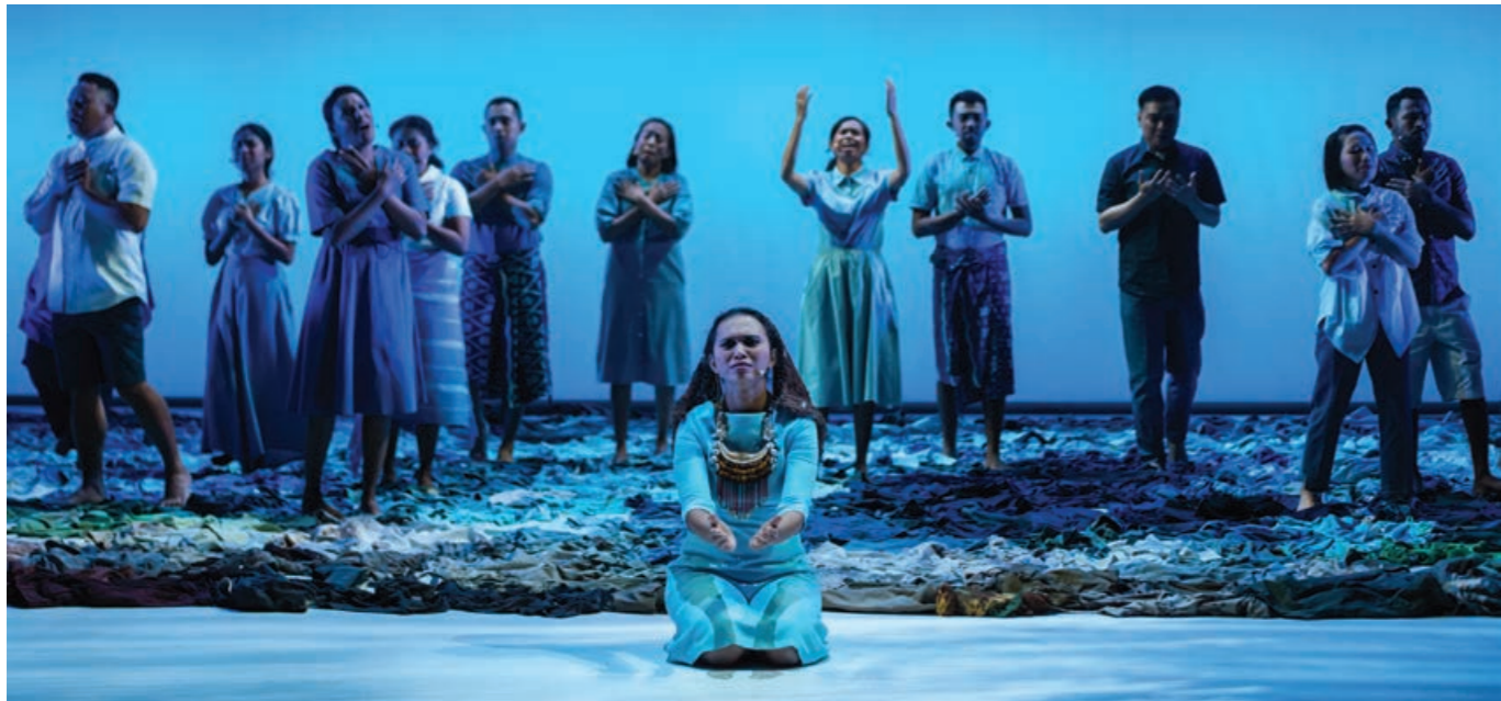
The Planet – A Lament by Garin Nugroho. World premiere presented as part of Asia TOPA.