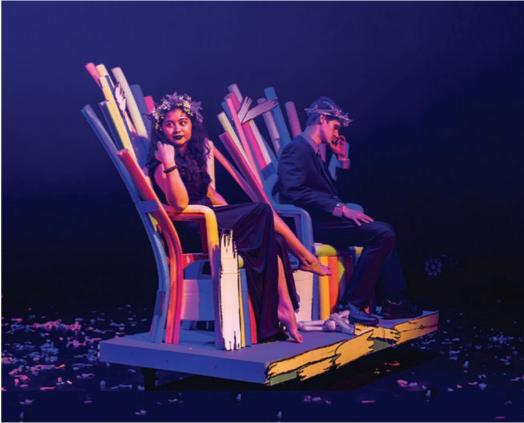
Western Edge Youth Arts' Orpheus & Eurydice by Victoria University Secondary College.