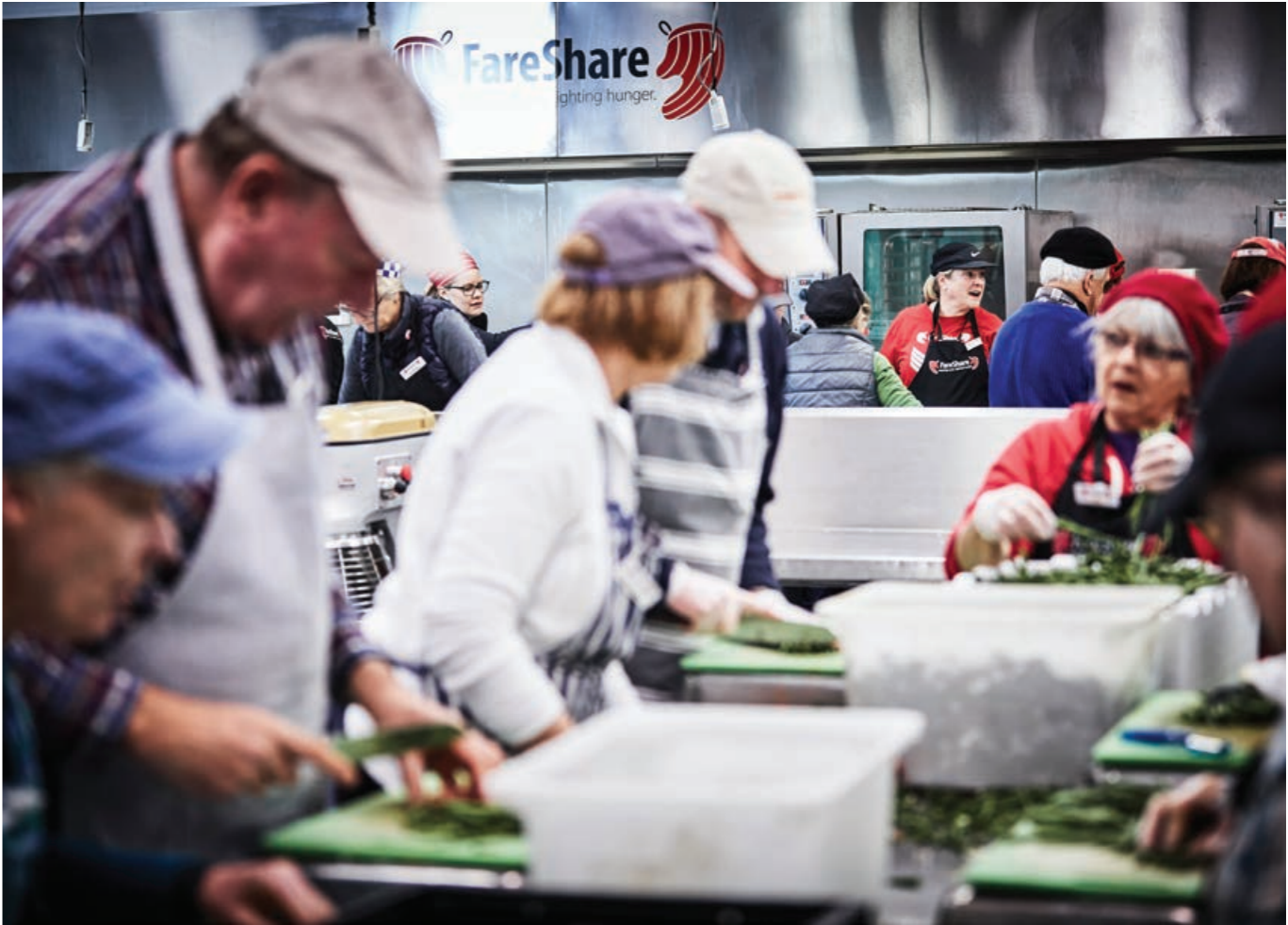
Fareshare with the help of the Sidney Myer Fund produces 2,000,000 meals every year.