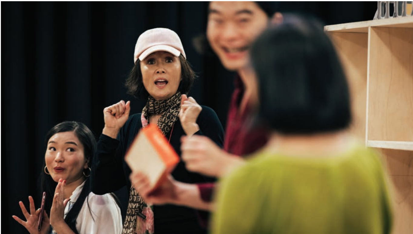
Melbourne Theatre Company’s production of Torch the Place (a Next Stage commission) in rehearsal