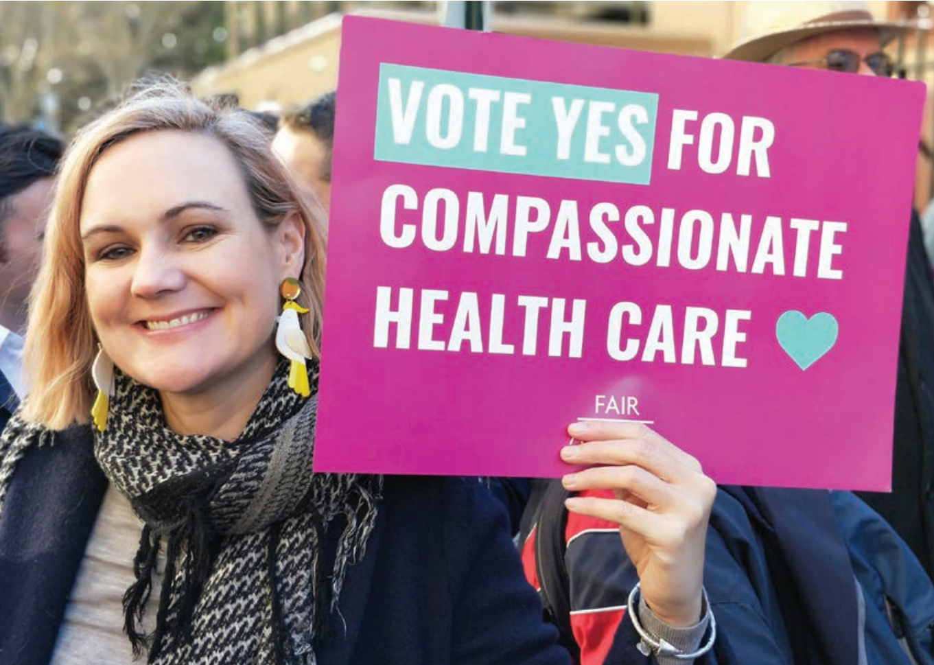
Fair Agenda's 2019 campaign helped more NSW women access reproductive health care