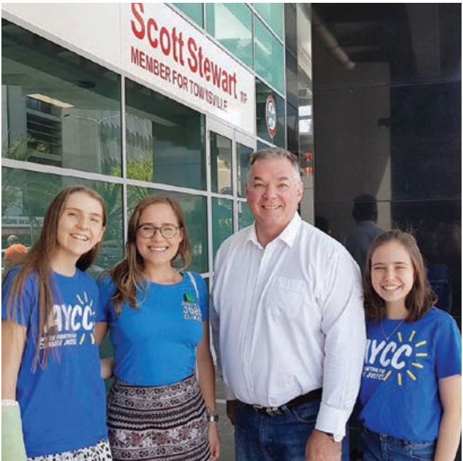
AYCC representatives in Queensland