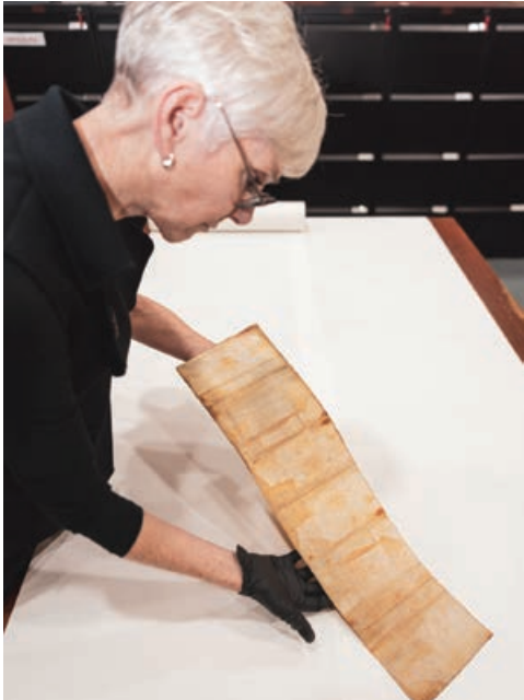
Royal Historical Society