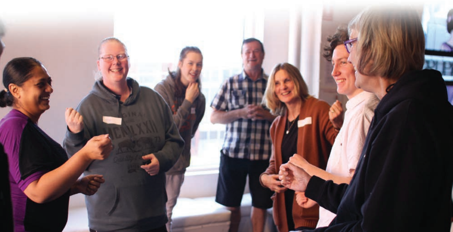
Below: Reach Foundation