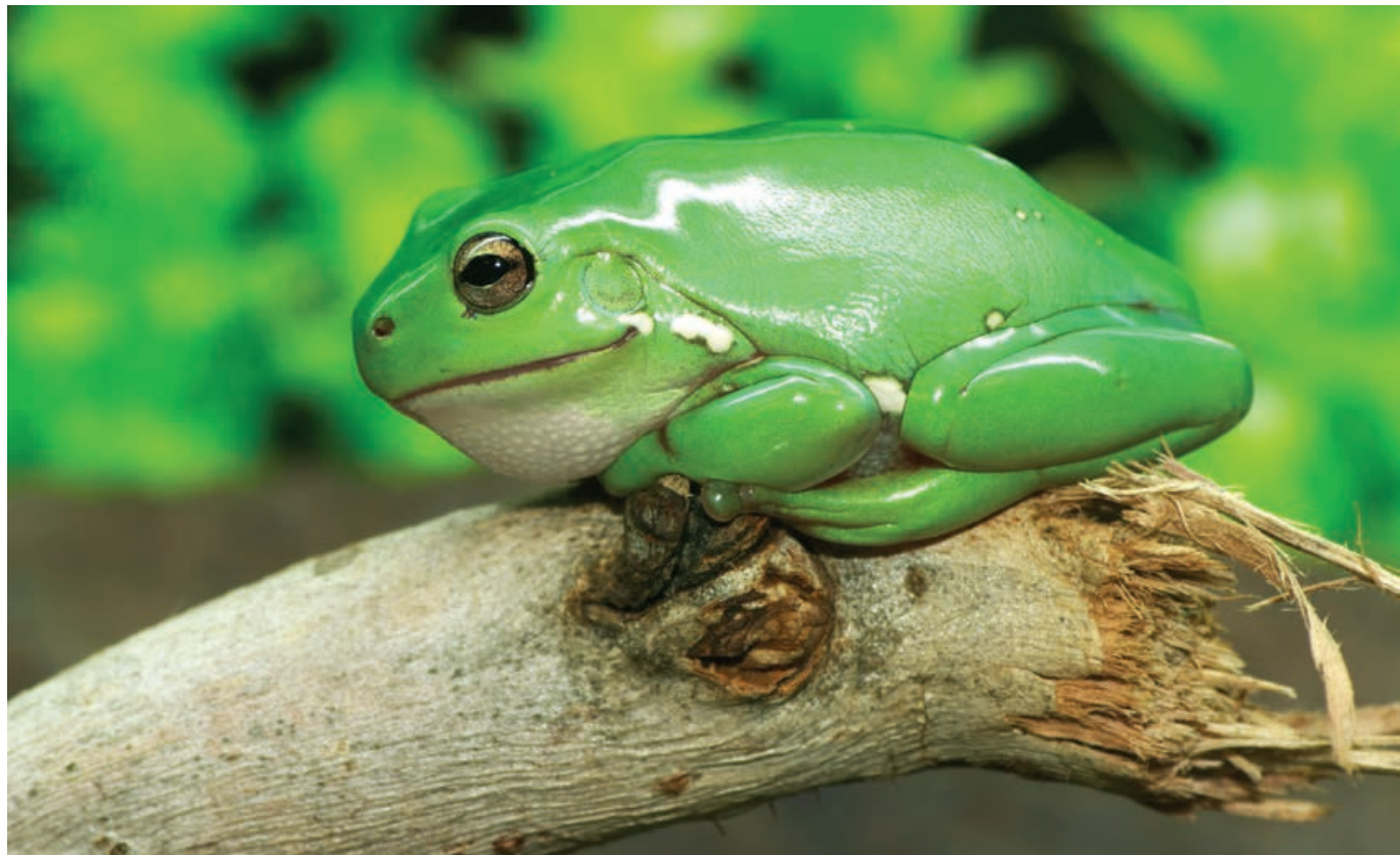
The green tree frog is just one of thousands of species the Environmental Defenders Office is fighting for.

Sustainability & Environment grantmaking was considered in the challenging circumstances of the COVID-19 crisis and the risk that key decision and policymakers would be distracted from the urgent actions that must be taken to achieve net zero emissions by 2050. The benefit of awarding multi-year untied support to organisations demonstrating consistent and scaleable impact was never clearer. In pursuit of our focus area to support organisations that seek to influence key stakeholders to take action on climate change, the Committee has taken a portfolio approach to grantmaking, and