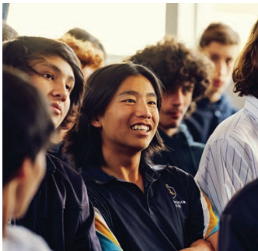
The Man Cave

in the coming years' grantmaking rounds. Reaching these communities became even more difficult once the COVID-19 social distancing regulations were introduced. This difficulty only strengthened our resolve however as the challenges created by the bushfire crisis have not disappeared nor can they be deprioritised in the face of this new catastrophe. The COVID-19 crisis will significantly impact bushfire victims. By addressing its funding to those communities already in distress, the Mental Health Committee aims to help alleviate the suffering created by this new emergency. In adopting this strategy, the Committee was able to provide some ongoing support to Murdoch Children's Research Institute,