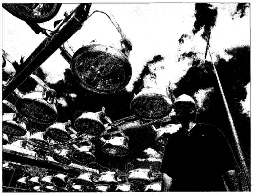
Sports highlight: Fallon Services has completed the largest sports lighting installation in Australia at Corbould Park racecourse on Queensland's Sunshine Coast.

"We have an excellent design regarded as one of the best in capability and have the capacity Australia and in addition to the to complete large projects