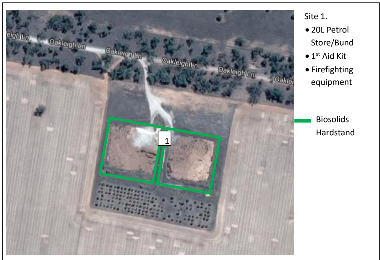
Figure 1. Oakleigh Hardstand Aerial Map