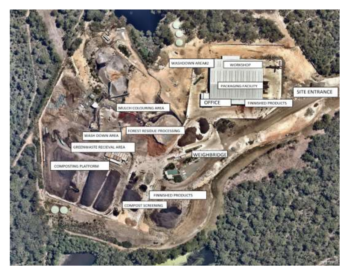
Figure 1 – 12 Pindimar Rd, Tea Gardens, NSW 2324