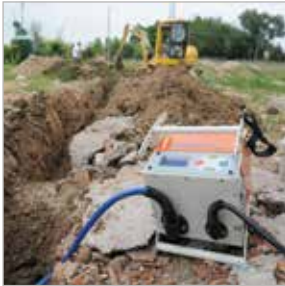
Electrofusion Pressure Welders

Matrix Piping Systems not only offers complete polyethylene piping systems but the tooling & equipment required to put it all together. Electrofusion & Butt Welding machines along with rotary pipe scrapers are all available for purchase or hire or, ask us about our hire/purchase arrangement.