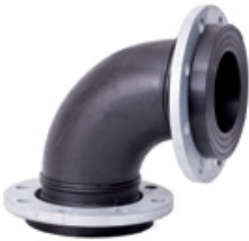
FLANGED BENDS 90°