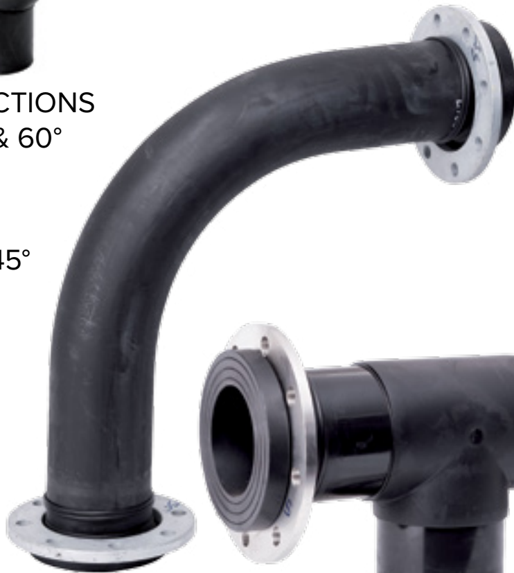
FLANGED SWEEP BENDS 90°