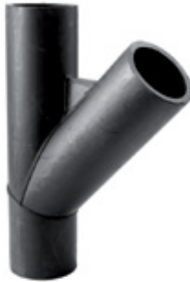
Y JUNCTIONS 45° & 60°