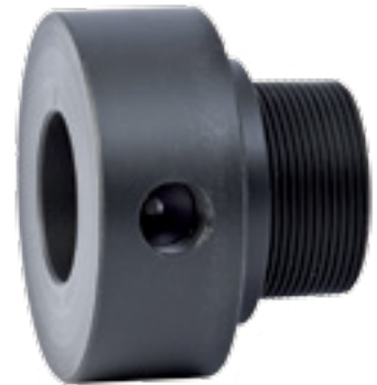
CUSTOM MACHINED FITTINGS