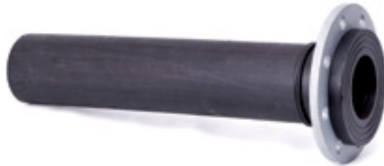
EXTENDED STUB FLANGES