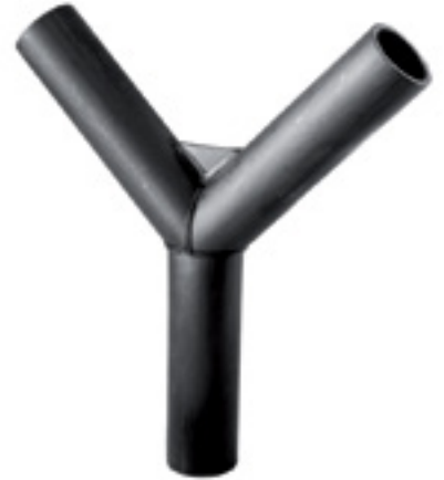
TRUE Y PIECES 90° & 60°