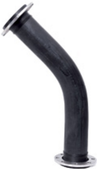
FLANGED SWEEP BENDS 45°