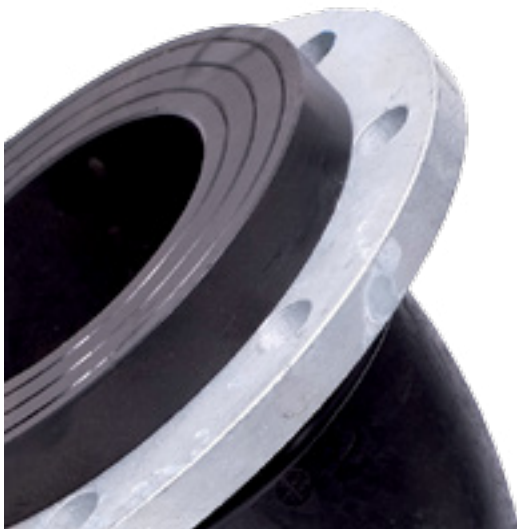
FLANGED BENDS 45°

Matrix Piping Systems have a prefabrication workshop which specialises in fabricating PE Pipe & Sheet. We make to order: manifolds, pipe spools, flanged bends & tees, offsets and reducing tees, all to your specifications.