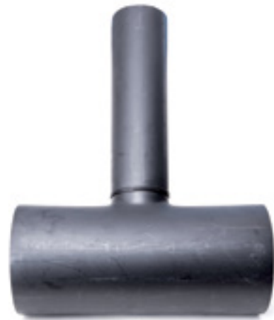
PULLED REDUCING TEES