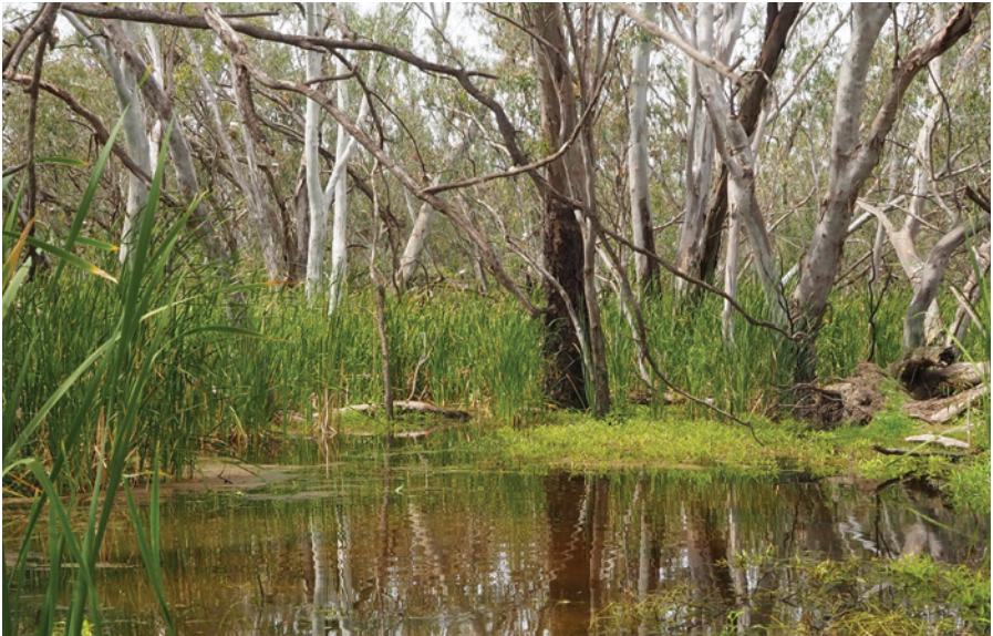
Widespread flooding from rains across eastern Australia breathes new life into the Macquarie Marshes (October 2022). NSW is proposing to licence floodplain harvesting in the Macquarie valley without adequate safeguards.