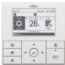
UTY-RVNYN Backlit Wired Remote Controller (High Grade)*