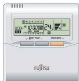
UTY-RNNYN Wired Remote Controller*