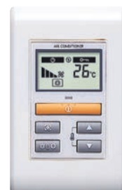
UTY-RSNNYN Simple Wired Controller*

*Optional Communication Kit (UTY-TWBXF1) is required for connection to the ASTG09/12/18/22LVCC models.