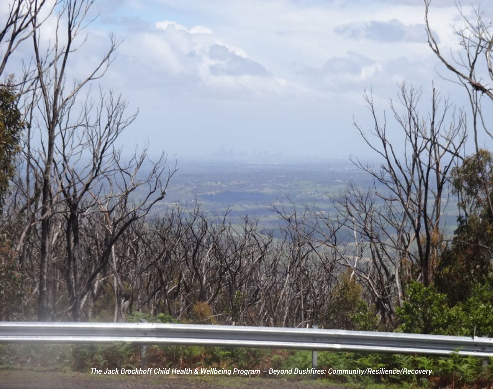
The Jack Brockhoff Child Health & Wellbeing Program – Beyond Bushfires: Community/Resilience/Recovery