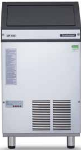
Flake ice residual water content 25%