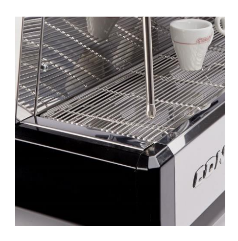
BOEMA COFFEE MACHINES Unit 8/1 Cowpasture PI, Wetherill Park NSW 2164