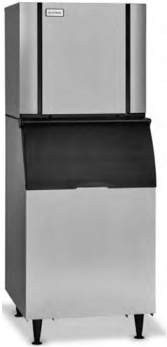
CIM1135 ON ICB230