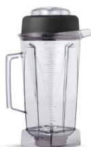
1.4L Standard Container with Lid and Blade Assembly