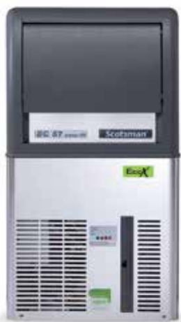
Medium gourmet cube 20g, 30mm dia x H 34mm

ECM 57 AS Medium gourmet cube 20g, Ø30mm x 34mm