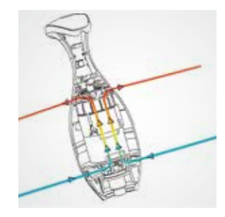
Air cooling system permits to work longer without overheating.