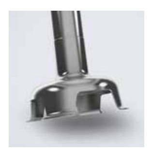
International Standards in line with the highest international safety standards which require limited access to the rotating knife.