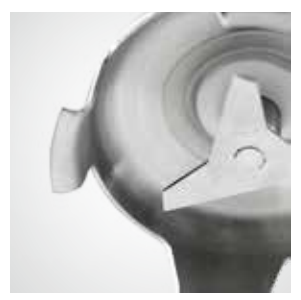
Durability guaranteed thanks to the easily removable blade that can be sharpened or replaced