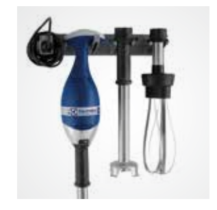
Supplied with wall support