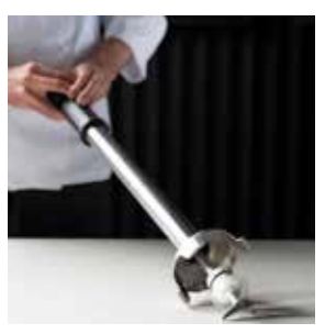
Food Safety Quick and easy disassembly of tube, shaft and blade without tools and dish-washable safe for better sanitation.