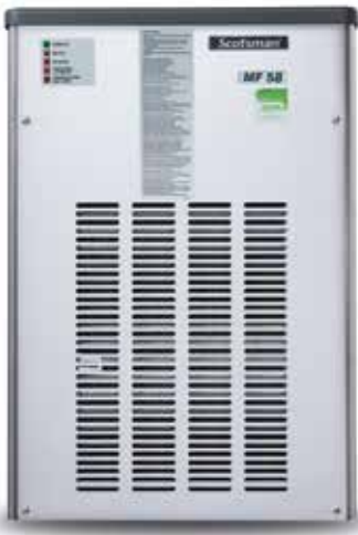
Nugget ice 1g – Ø11mm x H 13mm