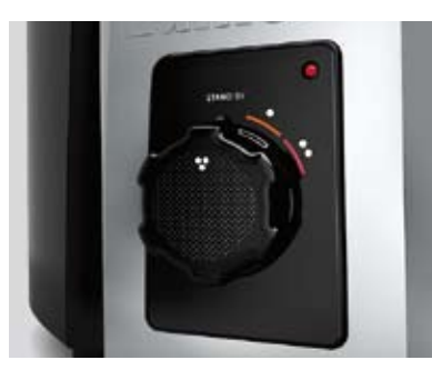
2 position selector: Soft Fruit. Hard vegetables.

For the first time a rear power switch has been incorporated to allow STAND BY status, thereby saving energy. Its intelligent selector, unique in the market, adapts the power to the type of fruit or vegetable.