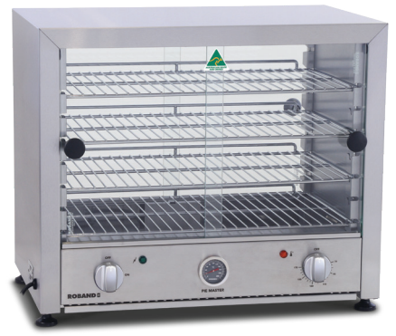
PM50G has glass doors both sides