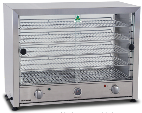
PM100L has internal light