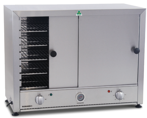
PM100S has stainless steel doors and a stainless steel back