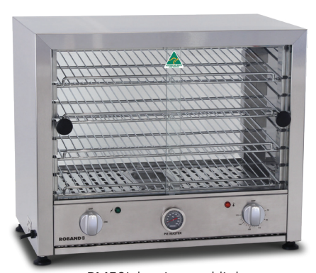
PM50L has internal light