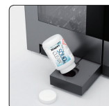
SOI ID CI FAN