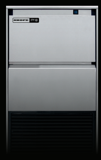
405 w x 515 d x 750 h (With adjustable legs 855 to 905 h mm)

ALFA - 17-21CC 39 w x 27 d x 30 h / mm (Average Dimensions)