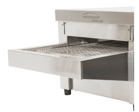
Long conveyor belt for easy loading