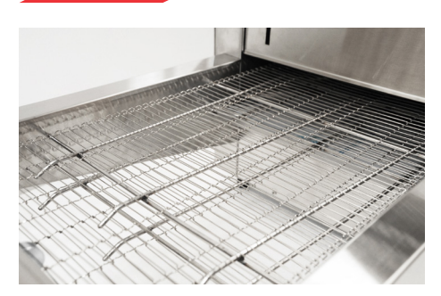
Belt extension for easy loading

The Snack Master Small is sized to fit on any benchtop, allowing for perfect toasting.