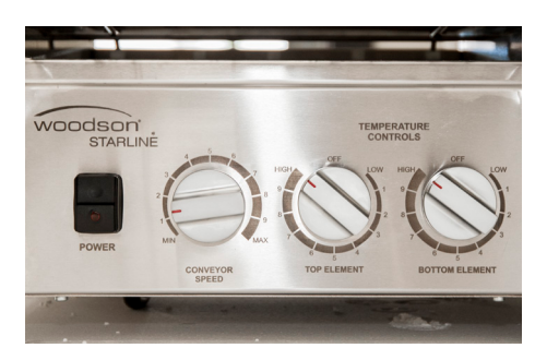
Individual temperature and speed controls

We reserve the right to alter specifications of products without notice. All dimensions are in mm.