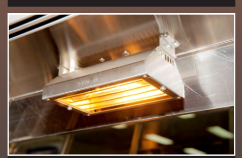
Quartz infra-red overhead heat lamps