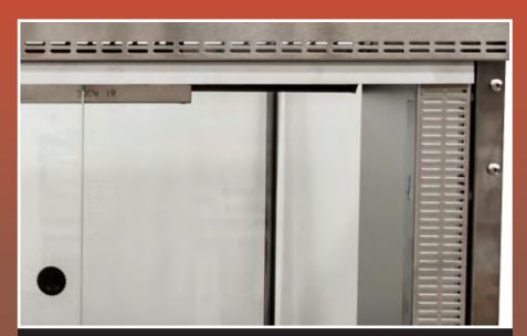
Rear ventilation prevents condensation