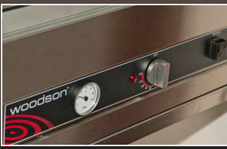
Precise thermostat control