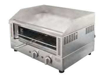
W.GDT65.20 8mm thick steel Griddle Plate 540 x 417 x 344 6 slice capacity 4.3kW 20A plug & lead fitted