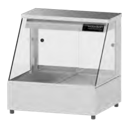
W.HFS22 2 Rows, 2 Bays 705 × 600 × 725 1.5kW 10A plug & lead fitted

Available accessories include pan kits, tray race, cutting boards, sneeze guards, trolleys, trolley panel kits and drop in kits.