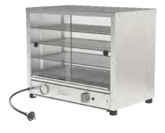
W.PIA50 / W.PIA50G

The PIM series comes standard with a modern black powder coated steel construction and toughened glass sliding door to front and back. Offering the perfect combination of functionality and attractive appeal with it's angled display racks, lightbox for branding, full internal lighting to improve the display and separate illuminated power and light switches.