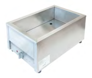
W.HFW11 1/1GN size hot food well 370 × 587 × 289 0.6kW 10A plug & lead fitted

W.BML21 2/1GN size bain marie 705 x 576 x 290 1.5kW 10A plug & lead fitted