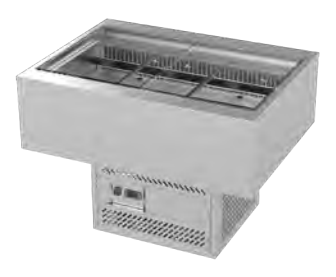
W.CFSSN23 2 Rows, 3 Bays 1070 x 800 x 342 0.75kW 10A plug & lead fitted

Available accessories include pan kits, drop down work shelf, trolley and trolley panel kits.