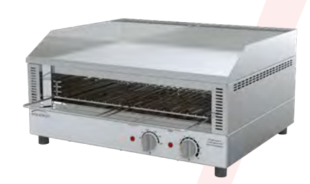
W.GDT75 8mm thick steel Griddle Plate 687 x 564 x 344 8 slice capacity 6.6kW 30A lead only