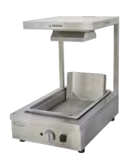
W.CD.B.11 1 x 1/1GN 100mm Deep Pan 405 x 619 x 636 1.0kW 10A plug & lead fitted

Autolift Fryer - 11 Litre Pan 272 x 666 x 456 15kg of frozen 10mm chips per/hr 4.8kW 20A plug & lead fitted