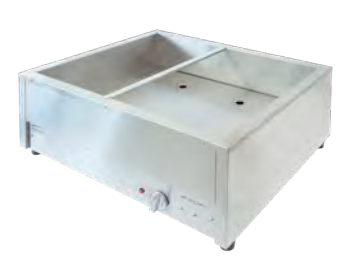
W.HFW21 2/1GN size hot food well 705 x 587 x 289 1.2kW 10A plug & lead fitted