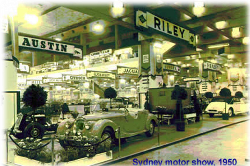
Sydney motor show, 1950

Of course, we're talking about averages here, so if you're sitting in Sydney facing hefty insurance prices and expensive parking, you're probably exceeding the country average. But if we are considering Rileys, think of the savings from discounted insurance, registration and cheap parts through our club. And you are probably not paying it off. When you turn your attention to other parts of the world, where salaries are lower and both cars and maintenance can be more difficult to source, you'll have some serious ownership costs. Turkey is the most expensive country in which to own a car. It costs a whopping 652.29 per cent of the average salary to drive. I do not know of any Rileys in Turkey.