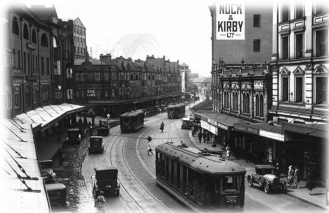
1931 A VIEW OF GEORGE ST FROM GROSVENOR ST LOOKING NORTH TO SYDNEY HARBOUR BRIDGE UNDER CONSTRUCTION