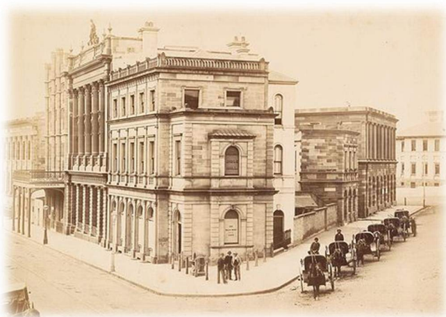
1880 CIRCA CORNER OF PITT & SPRING