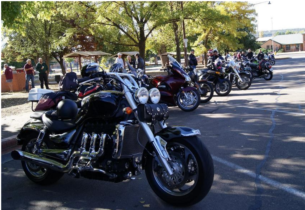
A great roll up for the Charity Ride – May 2010