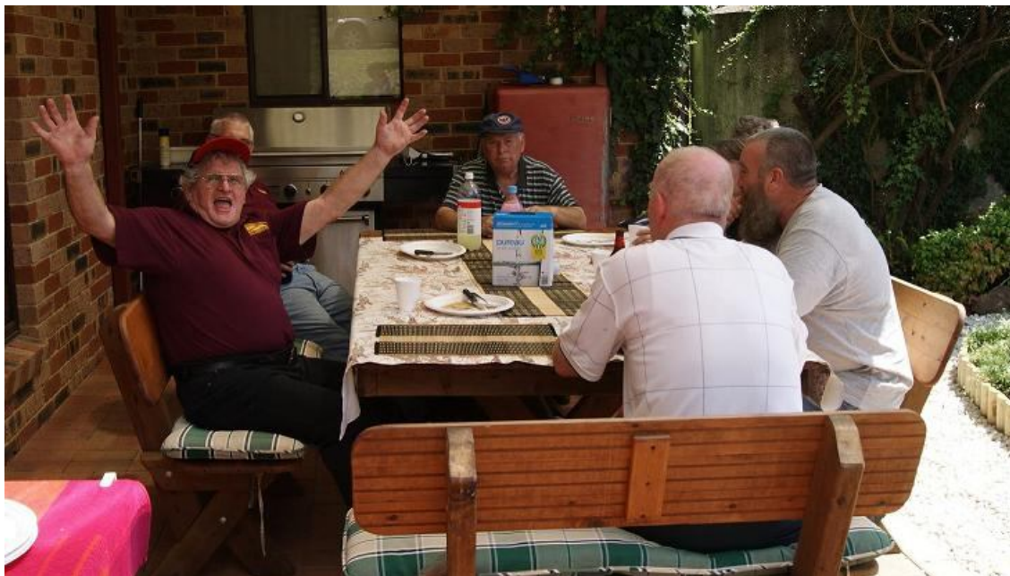
A well fed group of happy riders