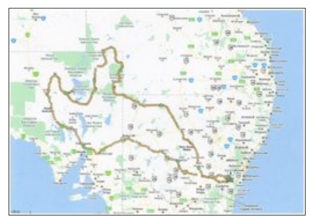
Lakes, Ivanhoe and West Wyalong. (5191 km in 8 days riding). Great Trip.