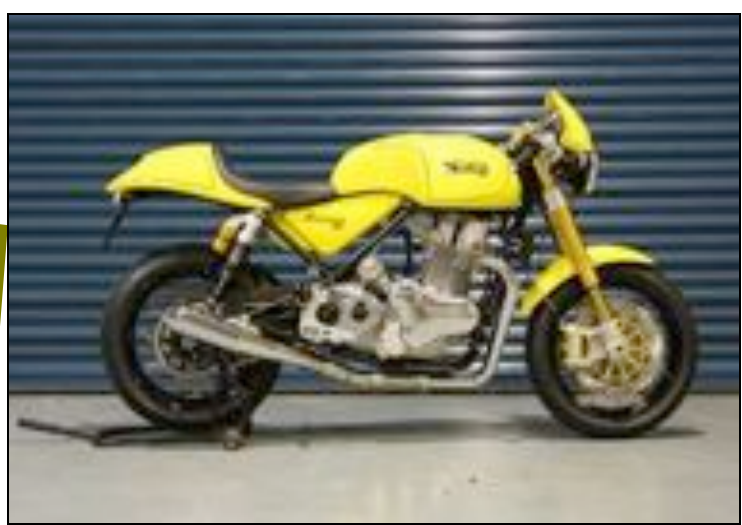
The new Norton Commando 961cc Cafe Racer