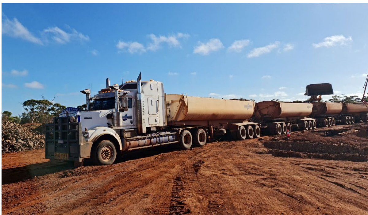
Figure 1: First stockpiles of Lucky Strike Ore being loaded.

Lefroy Exploration Limited (“ Lefroy ” or “ the Company ”) (ASX: LEX) is pleased to report on the Company’s inaugural toll-milling campaign and mining progress at the Lucky Strike Gold Mine near Kalgoorlie in Western Australia.