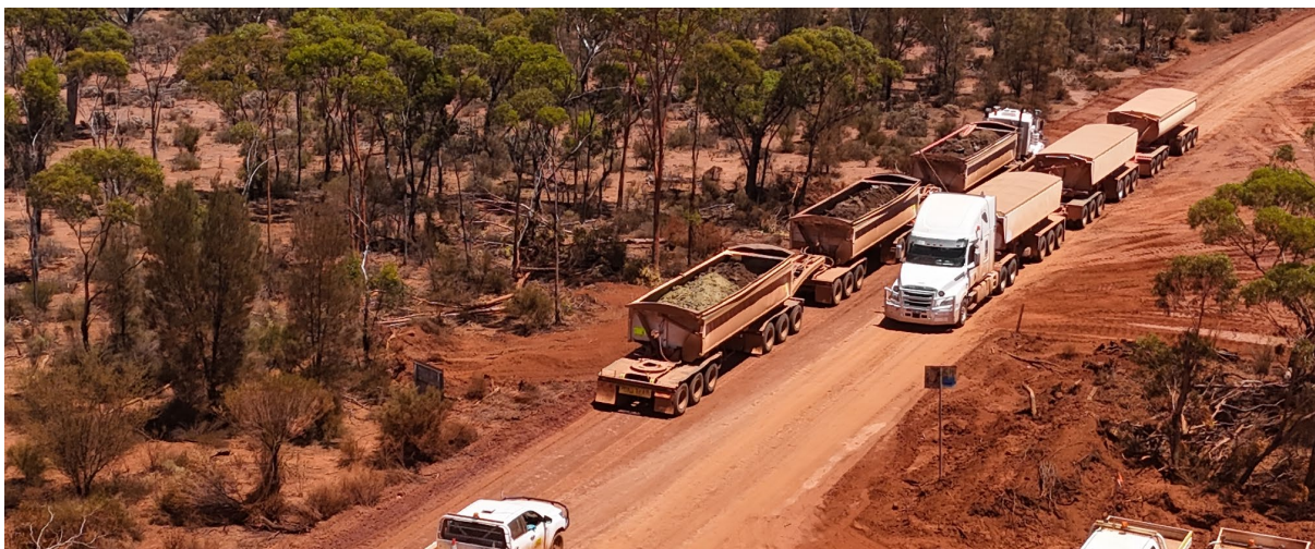
Figure 2: Lucky Strike ore haulage underway to Greenfields Mill (FMR) in Coolgardie

In June 2025, the Company announced that a one-month (February 2026) toll-milling slot had been secured between mine profit share partners BML Ventures Pty Ltd (BML) and FMR Investments Pty Ltd (FMR) utilising the Greenfields Mill in Coolgardie (refer ASX announcement 10 June 2025).