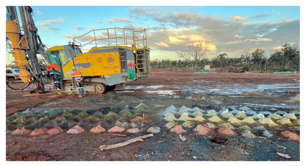
Figure 2: Grade Control RC Drilling Program well advanced at Lucky Strike.

The first phase of grade control drilling remains on target to be completed by the end of June (9200m drilled of a total 16,500m planned), with the Company particularly encouraged by the exceptional assay results received in early June (refer ASX release 3 June 2025).