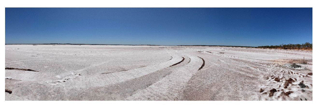
Figure 2. Photo looking south over Lake Randall, with Burns drill site area in the foreground.

Figure 1 . Inset map of Burns highlighting the extent of the recent AC drilling on Lake Randall, interpreted extent of the Eastern Porphyry and area of infill drilling currently underway. Grey stars represent AC holes with pending results. Refer to Figures 2 & 3 in LEX ASX release dated 21 February 2022 for location and regional context.