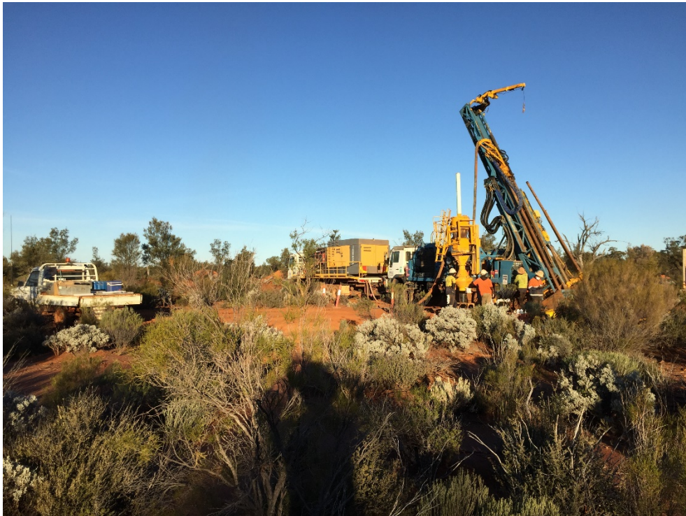
Figure 2 Photograph at drill site for hole LEFR133 on step out section line.