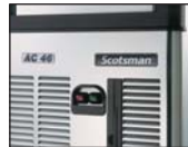
Front ON-OFF Switch