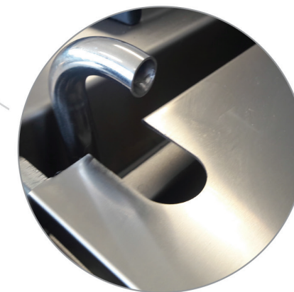
Automatic water-filling with a fixed tap located on the top.