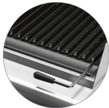
Distance from heat to grill plate is adjustable using side levers in order to provide different cooking temperatures.