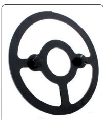
Blade Removal tool

* Not recommended for high moisture content foods. Tomatoes, lettuce, vegetables and cheese, etc.