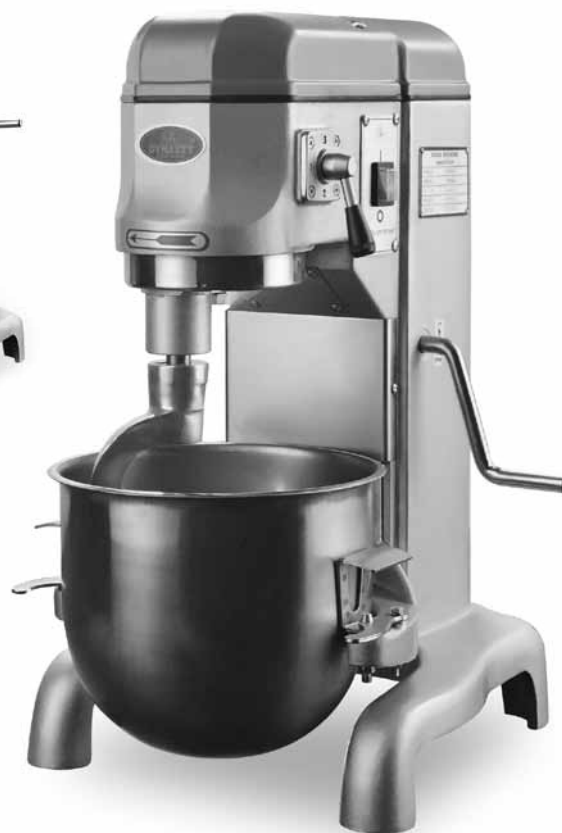
BM10AT without guard