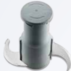
Smooth emulsifier blade