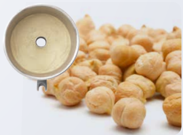
Hummus (Garbanzo beans)