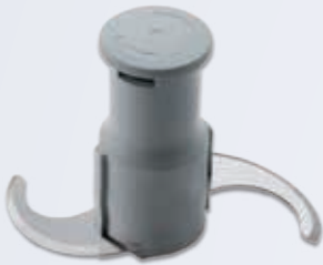
Smooth blade rotor

Smooth or micro-toothed blades to prepare everything from coarse meats to the finest creams.