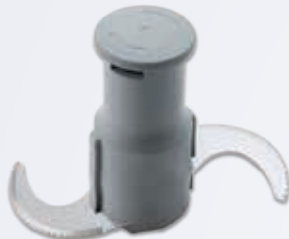
Micro-toothed blade rotor