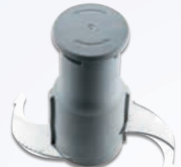
Smooth microtoothed emulsifier blade