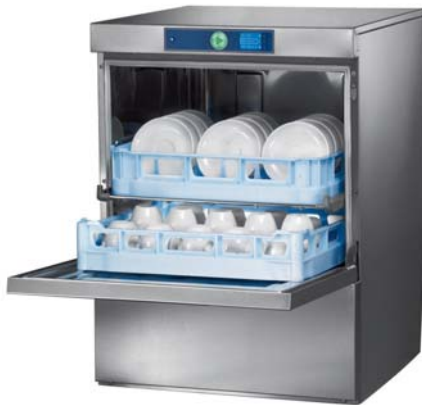
** Shown with optional double rack insert