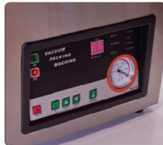
Simple control panel