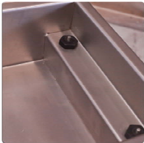
Removable Seal Bar

Independently risk assessed to ensure compliance with Australian Standards