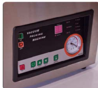
Simple control panel