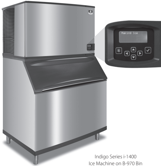
Indigo Series i-1400 Ice Machine on B-970 Bin

Designed for operators who know that ice is critical to their business, the Indigo™ Series ice machine's preventative diagnostics continually monitor itself for reliable ice production. Improvements in cleanliness and programmability make your ice machine easy to own and less expensive to operate.