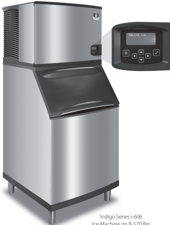
Indigo Series i-606 Ice Machine on B-570 Bin

Designed for operators who know that ice is critical to their business, the Indigo™ Series ice machine's preventative diagnostics continually monitor itself for reliable ice production. Improvements in cleanability and programmability make your ice machine easy to own and less expensive to operate.