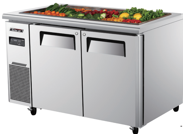
- Pans not included.