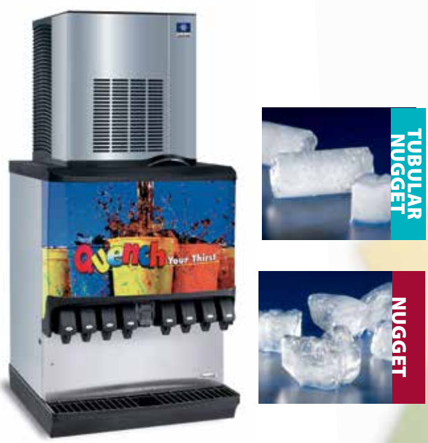
RN-0408A nugget ice machine on Servend® SV-250 beverage dispenser