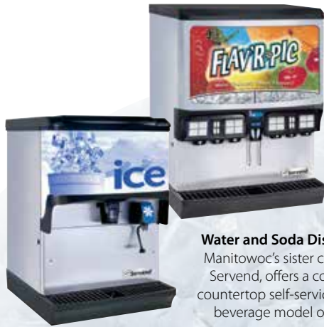
Water and Soda Dispensers Manitowoc's sister company, Servend, offers a complete countertop self-service ice and beverage model offering.

Find the perfect ice machine pairing with Manitowoc's wide variety of ice storage bins and dispensers.