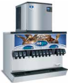
i-322 ice machine on Servend® MDH-302 beverage dispenser

Manitowoc dice or half dice cubes crushed into small pieces using a Maniowoc ice machine and a Servend® beverage dispenser equipped with icepic™ ice crusher. Provides a selection of crushed or cubed ice from a single ice maker/ice-beverage dispenser combination. Maximum cooling with nearly 100% ice to water ratio.