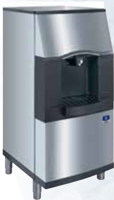
SPA and SFA Series Ice Dispensers

Featuring one-piece corrosion-free composite-resin base, impact-resistant polyethylene bin liner, soft durameter trim that helps silence bin closing, internal scoop holder and protectant bumper guards.