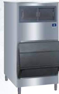
F-Style Large Capacity Ice Storage Bins

Available in 22" (55.9 cm), 30" (76.2 cm) and 48" (121.9 cm) widths.