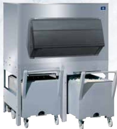
Ice Storage Bin and Cart System

Equipped with ice gate for increased employee safety, easier ice removal, and reduced spillage. The 30" (76.2 cm) model is one of the smallest footprint large capacity storage bins available.