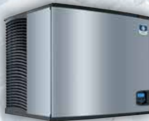
Modular Ice Machines

Featuring high-volume dispensing with patented "push-for-ice" rocking chute dispense mechanism and paddle wheel technology.