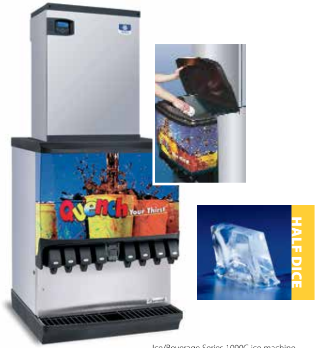
Ice/Beverage Series 1090C ice machine on Servend SV-250 beverage dispenser

This compact Ice/Beverage Series ice machine is available in high volume ice production capacities to satisfy nearly every beverage dispenser application at quick service restaurants, convenience stores, recreational or educational foodservice operations.