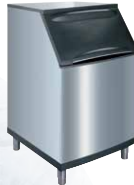
B-Style Ice Storage Bins

Available in 22" (55.9 cm) and 30" (76.2 cm) widths.