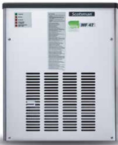
Superflake ice residual water content 15%