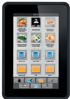
LCD 7" Touch Screen