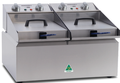
FR28 with pan covers