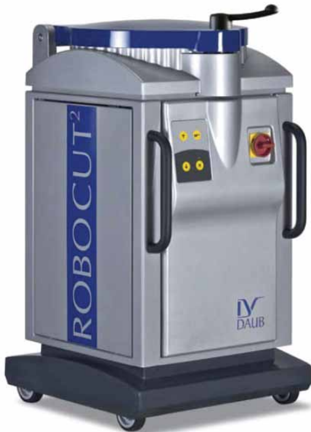
Robocut2 - R20T2