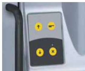
R20T2 Control Panel

In line with policy to continually develop and improve its products, Moffat reserves the right to change specifications and design without notice.